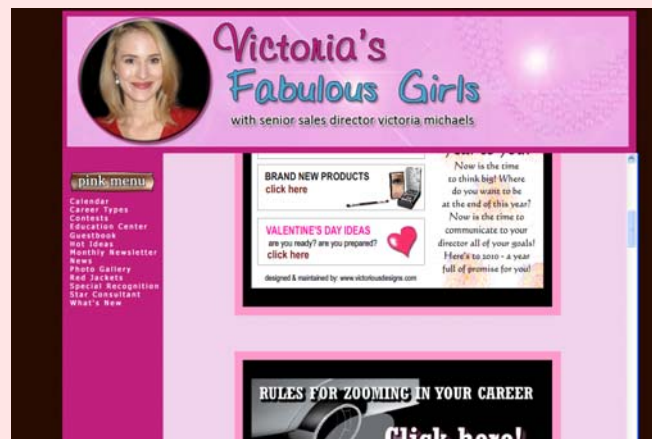
Template 4: Modern Pink

If you do not prefer these templates, we will CUSTOM design a new template for you at the starting price of $50 (this is in addition to the website setup fee).