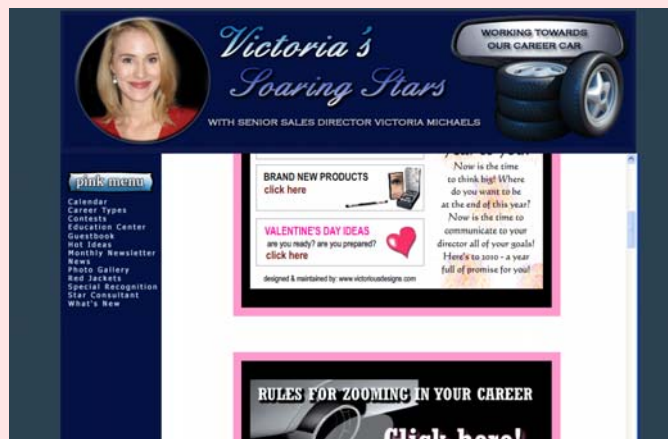
Template 3: Modern with Car