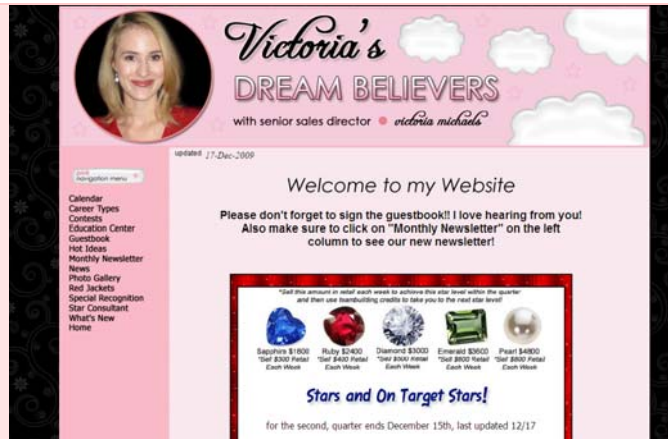
Template 1: Whimsical